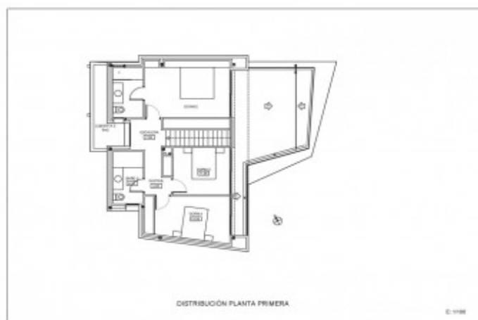
DISTRIBUCIÓN PLANTA PRIMERA