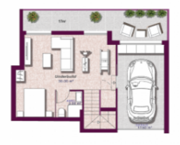
Garage - Underbuild